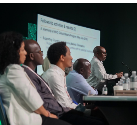
Alan Magill Fellowship Speakers